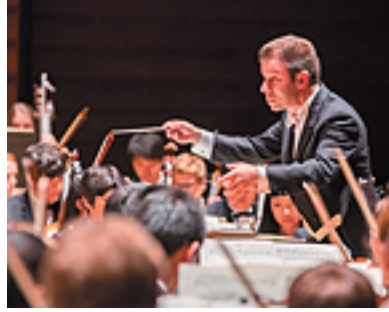
Maestro Scaglione in performance with PYO during the 73rd Annual Festival Concert.