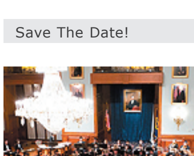
The newly renovated Lincoln Hall of The Union League of Philadelphia will host the upcoming PYO Gala showcase concert.

Friday, March 21, 2014 – 6:30 p.m. 2014 PYO Gala Dinner and Concert