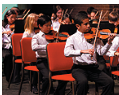
PRYSM members in concert at Centennial Hall of The Haverford School.