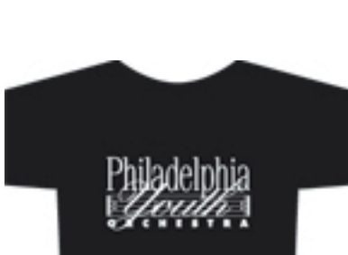
The new PYO T-shirt design

The PYO t-shirt sales have been record-breaking...what we thought would engender interest from about 75, has turned into orders in excess of 150! Keep them coming! We are grateful for your loyalty and enthusiasm to walk out in these as ambassadors of this fine organization empowering young musicians and preparing them for a life-long of excellence!