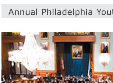
Please join us for the PYO gala in the newly renovated Lincoln Hall.