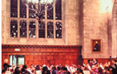
PRYSM & PRYSM Young Artists in rehearsal in the magnificent Thomas Great Hall of Bryn Mawr College.