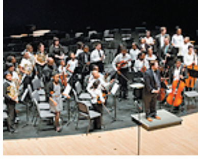
Philadelphia Youth Orchestra 73rd Anniversary Gala in the Kimmel Center's Perelman Theater.