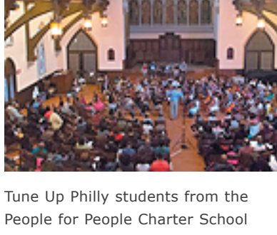
Tune Up Philly students from the People for People Charter School and the Salvation Army Kroc Center gather to inspire and grow.