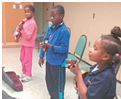
Students from the Kroc Center preparing for our upcoming concert

On December 21st at 3:00 p.m., join Tune Up Philly for its family-friendly Holiday concert at the Trinity Center for Urban Life at 22nd and Spruce Streets in Center City.